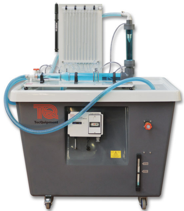
SHOWN FITTED TO THE DIGITAL HYDRAULIC BENCH (H1F)

*This product will also work with existing TecQuipment Gravimetric and Volumetric Hydraulic Benches (H1 and H1D)