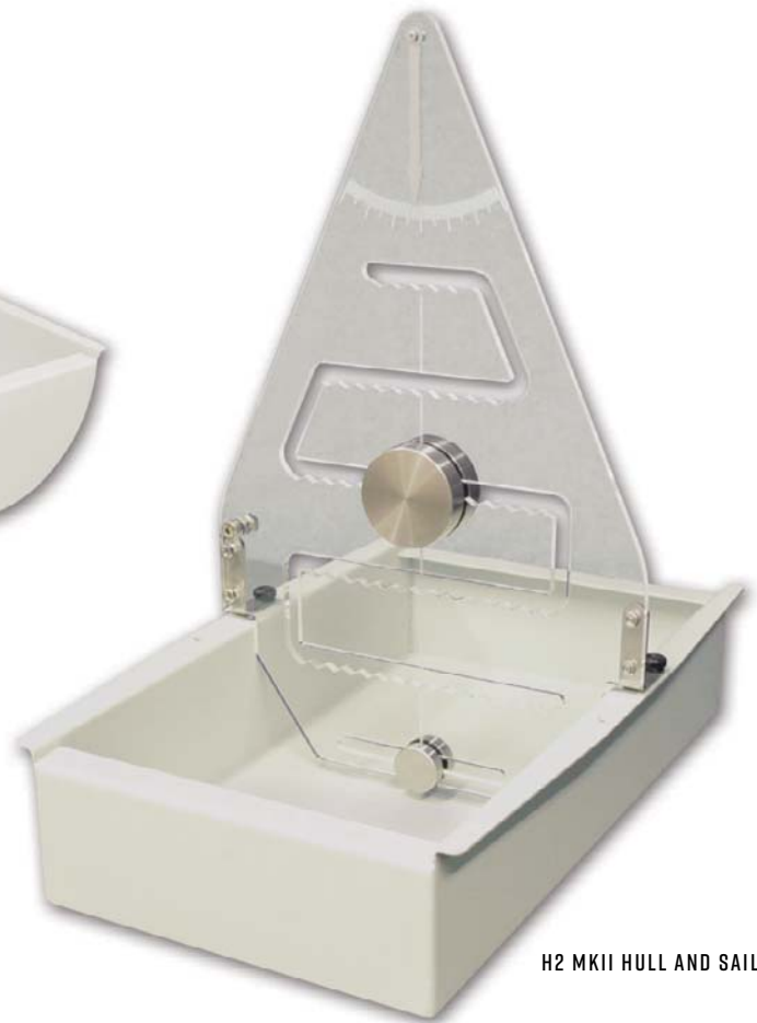
H2 MKII HULL AND SAIL