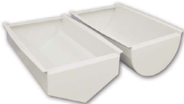
OPTIONAL VEE (HARD) CHINE AND HALF ROUND (ROUND BILGE) HULLS (H2A MKII)