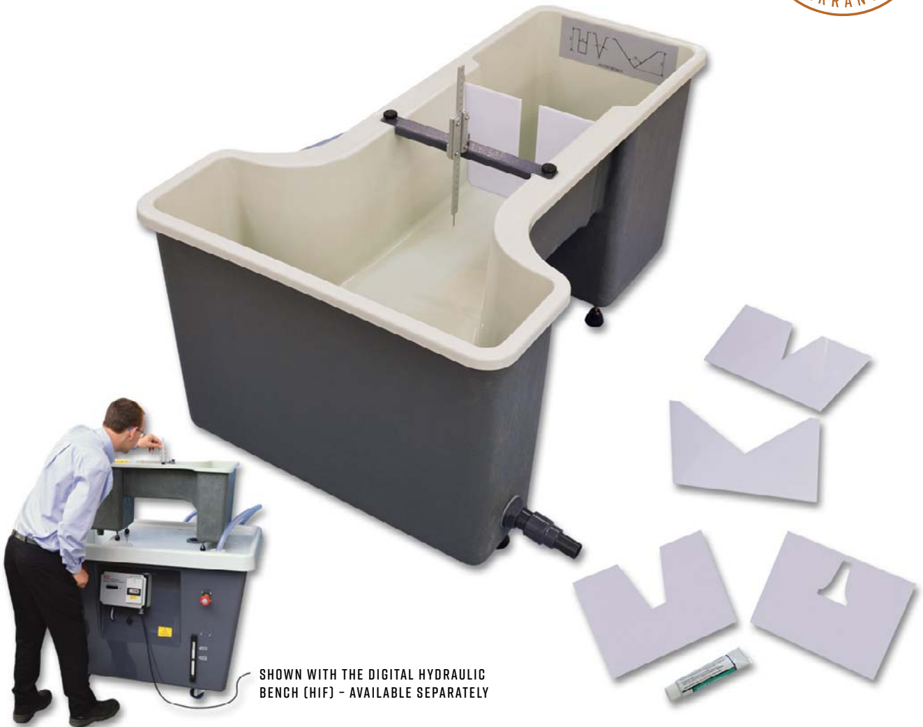
SHOWN WITH THE DIGITAL HYDRAULIC BENCH (HIF) - AVAILABLE SEPARATELY