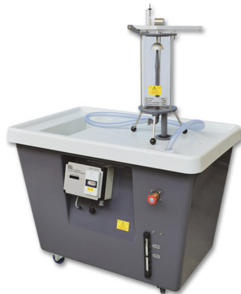
SHOWN MOUNTED ON THE DIGITAL HYDRAULIC BENCH (H1F) - AVAILABLE SEPARATELY