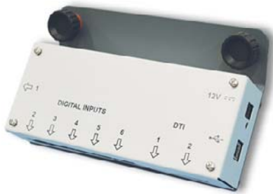
USB INTERFACE HUB (WITH VDAS ® ONBOARD)