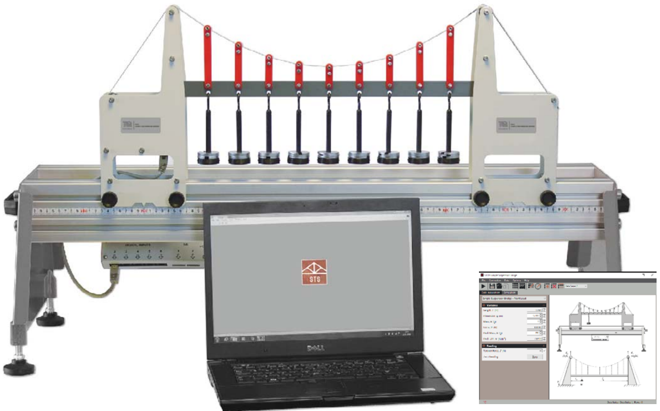
SHOWN FITTED TO THE STRUCTURES PLATFORM (STS1, AVAILABLE SEPARATELY) LAPTOP NOT INCLUDED

Experiment for the study of the characteristics of a simple suspension bridge. Mounts on the Structures platform and connects to the Structures automatic data acquisition unit and software (VDAS® Onboard).