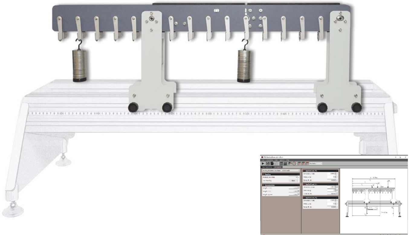
SCREENSHOT OF THE VDAS® SOFTWARE

Experiment that illustrates and proves the basic theory of bending moments in a beam. Mounts on the Structures platform and connects to the Structures automatic data acquisition unit and software (VDAS® Onboard).