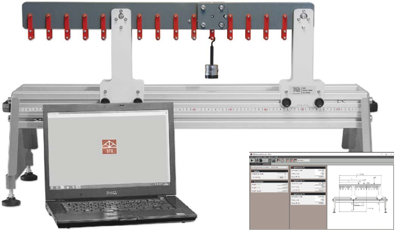
SHOWN FITTED TO THE STRUCTURES PLATFORM (STS1, AVAILABLE SEPARATELY) LAPTOP NOT INCLUDED

Experiment that illustrates and proves the basic theory of shear force in a beam. Mounts on the Structures platform and connects to the Structures automatic data acquisition unit and software (VDAS® Onboard).