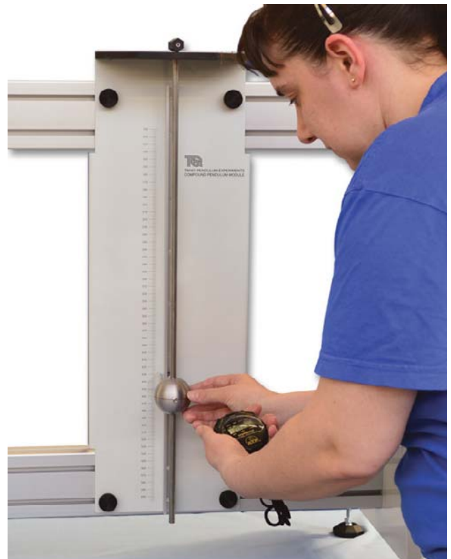
THE SIMPLE PENDULUM MODULE IN USE, SHOWN FITTED TO THE TEST FRAME (TM160)