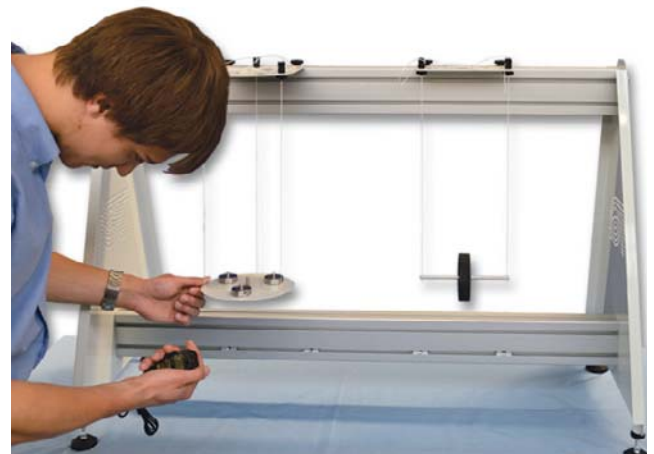
THE FILAR PENDULUMS MODULE IN USE, SHOWN FITTED TO THE TEST FRAME (TM160)

80% at temperatures < 31°C decreasing linearly to 50% at 40°C