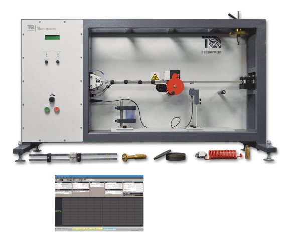
FREE AND FORCED VIBRATIONS (TMIOI6V)

Refer to separate datasheets for full details of each product.